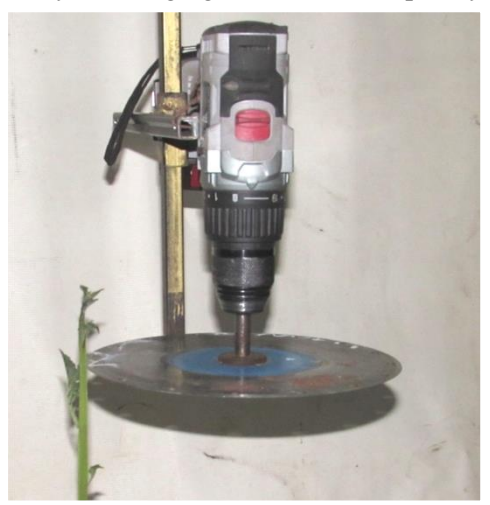
Fig. 2. Circular knife attachment

Experimental studies were carried out to assess the possibility of using such a design. The tool is shown in Fig. 2. The disc of the cutting device with the diameter of 230 mm was driven into rotation by an electric motor with the possibility of changing the rotation frequency.